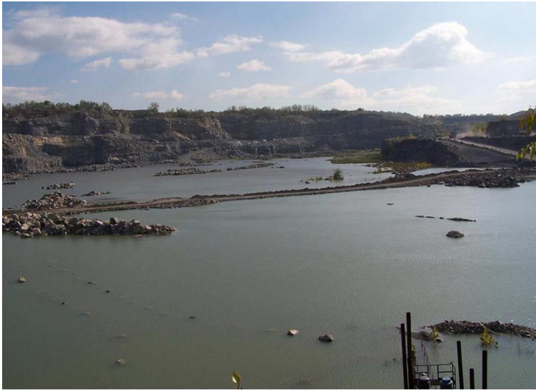
Quarry Karst Leak, N.Y. 30,000 GPM

30,000 GPM leaking through karst Stopped by Sub-Technical Inc.