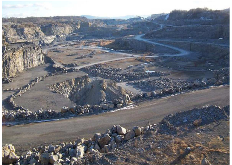
Quarry Karst Leak N.Y. 0 GPM